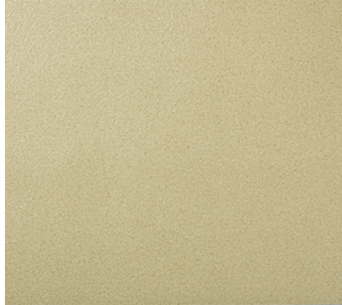
8652 Juparana Taupe