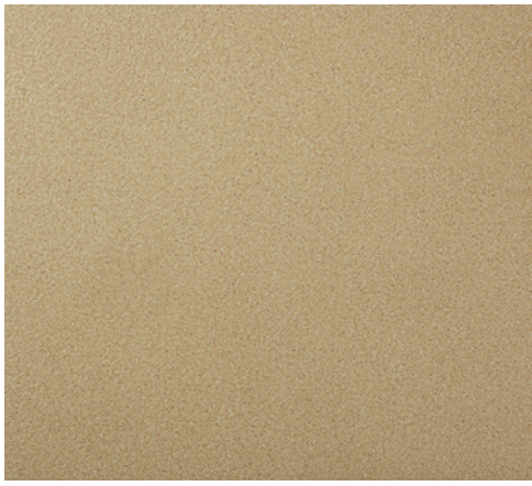
8604 Bianco Romano