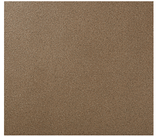
8639 Baltic Brown