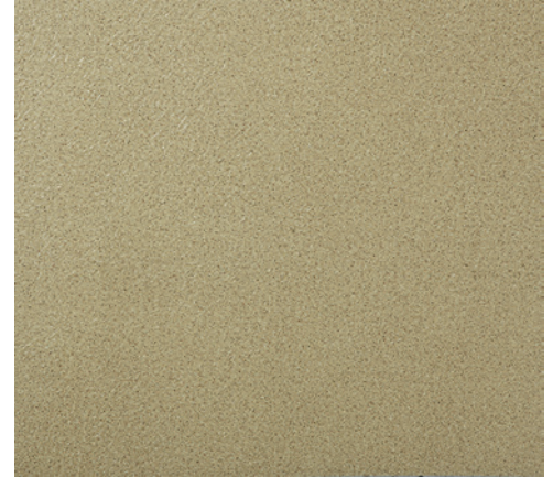
8653 Tan Baja