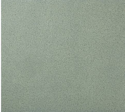
8642 Pearl Gray