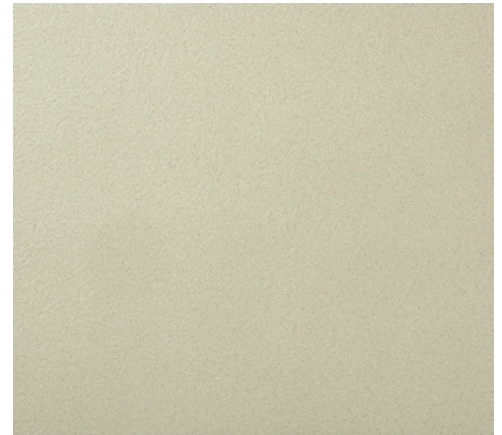
8661 Kashmere Creme