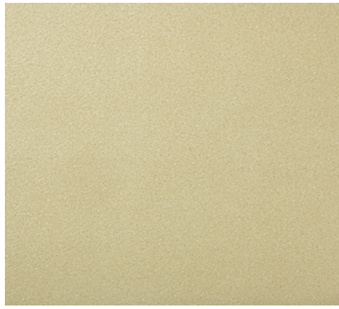
8612 Creme Bahia