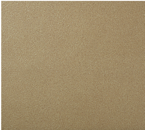
8654 Ikon Tan