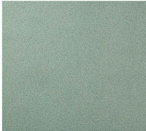
8658 Ayes Green