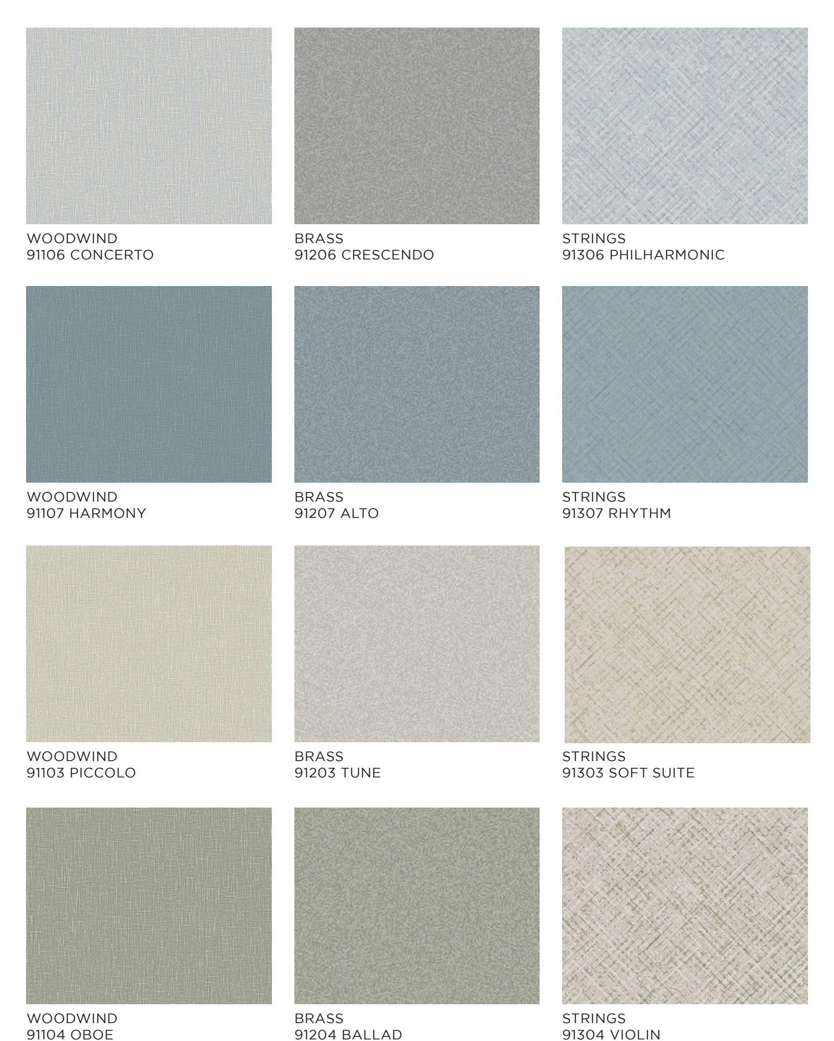
NOTE: Digital representation may differ from physical samples.